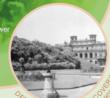
DEEPDENE GARDEN DISCOVERY Parterre and house, c.1900