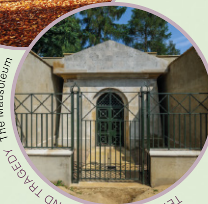
TEMPLE, TERRACE AND TRAGEDY The Mausoleum