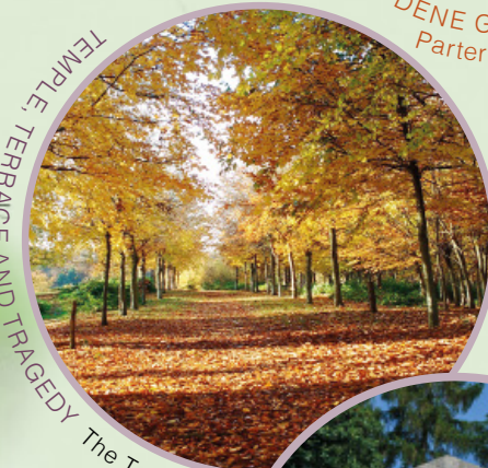
TEMPLE, TERRACE AND TRAGEDY The Terrace