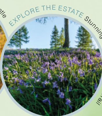
EXPLORE THE ESTATE Stunning Bluebells on The Trail