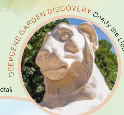
DEEPDENE GARDEN DISCOVERY Coady the Lion