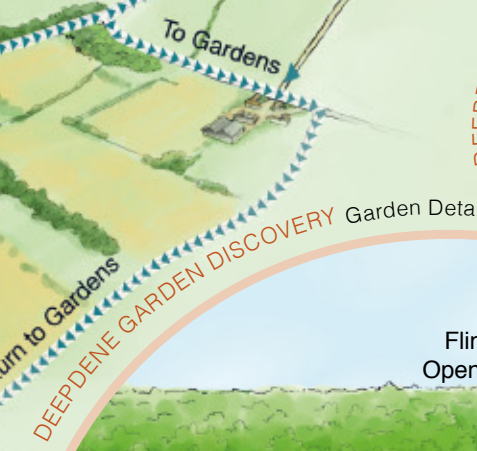
DEEPDENE GARDEN DISCOVERY Garden Detail