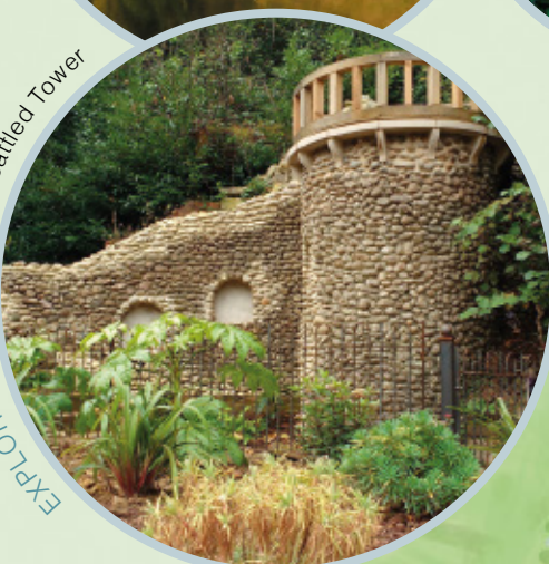
EXPLORE THE ESTATE Embattled Tower