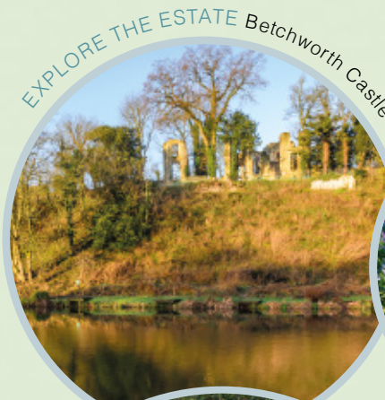
EXPLORE THE ESTATE Betchworth Castle